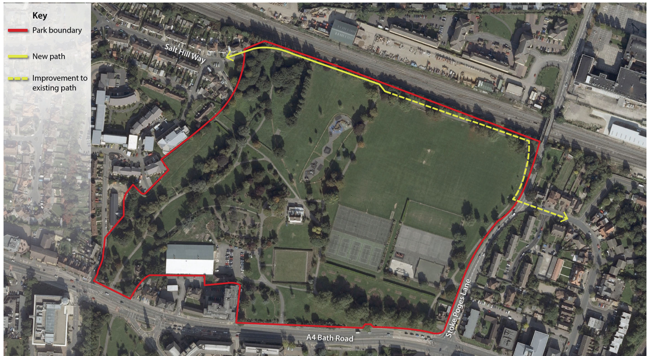
Figure 1 – Map showing the outline of Salt Hill Park (in red) and the proposed new route (in yellow).

environment. The new path will provide a high quality 3 metre wide shared use footpath with new surfacing, street lighting and improved visibility of the subway area to and from Salt Hill Way. Figure 1 below shows the location of the improved sections of path.