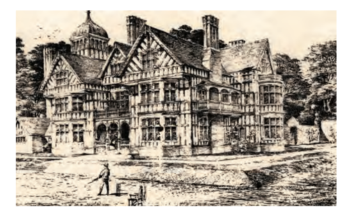
Architects Drawing of 'The Mere' c.1886

The Bentley Education Centre is housed in 'The Mere's' motor-carriage house. This is now believed to be the third oldest motor-carriage house in the country.