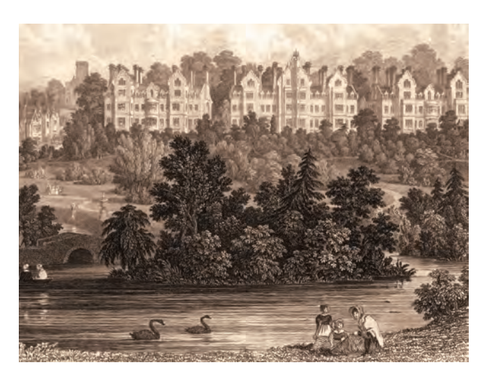
Engraving of Victoria Terrace c. 1843

During the 1990s, the houses were divided into a number of flats and a new row of houses and flats, fronting onto the park, was built and became known as Bulstrode Place.