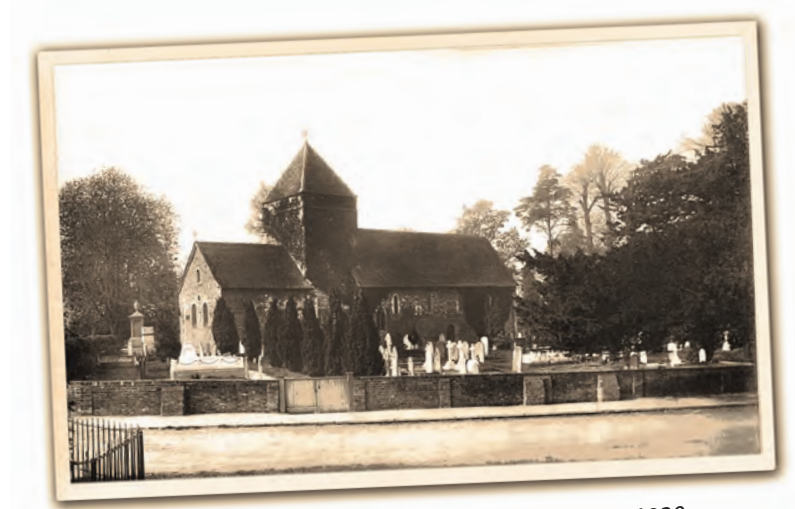
Church of St Laurence, Upton-cum-Chalvey c.1920

To access the church please refer to their website www.saint-laurence.com