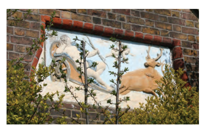
Frieze depicting the Goddess Diana on Diana Lodge

gold braid. From the 1870s, until c.1930, the lodge also housed the Upton Park Billiard Club and Reading Room. The Lodge is now divided in two.