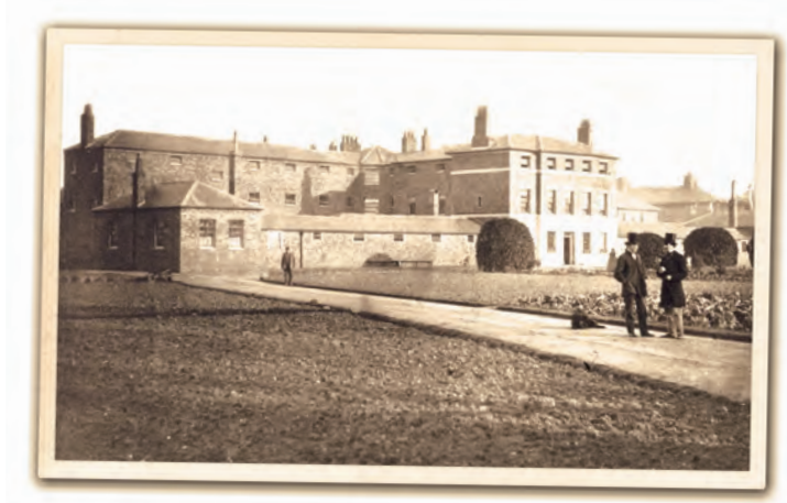
Eton Union Workhouse (now Upton Hospital) c.1880

The Eton Union Workhouse was known popularly as Albert House. In the 1930s, it was known as the Slough Public Assistance Institution and was run by Buckinghamshire County Council. In July 1948, it ceased to be a workhouse and was named Upton Hospital.