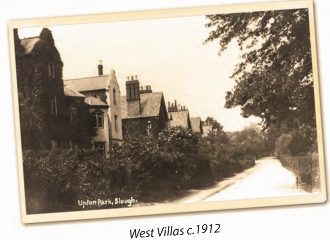
Mest Auras er

West Villas was part of the original layout of the Upton Park Estate. This included a carriage drive between the villas and the park, which was common practice in mid-Victorian parks. The villas towards the end of the drive are part of the original architectural scheme, while the more central villas were rebuilt in the 1990s. As you walk down West Villas, look out for the rather beautiful Arts and Crafts terracotta plaque dated 1885.