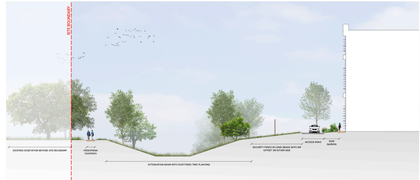
SECTION B-BB N 0 5 10 m