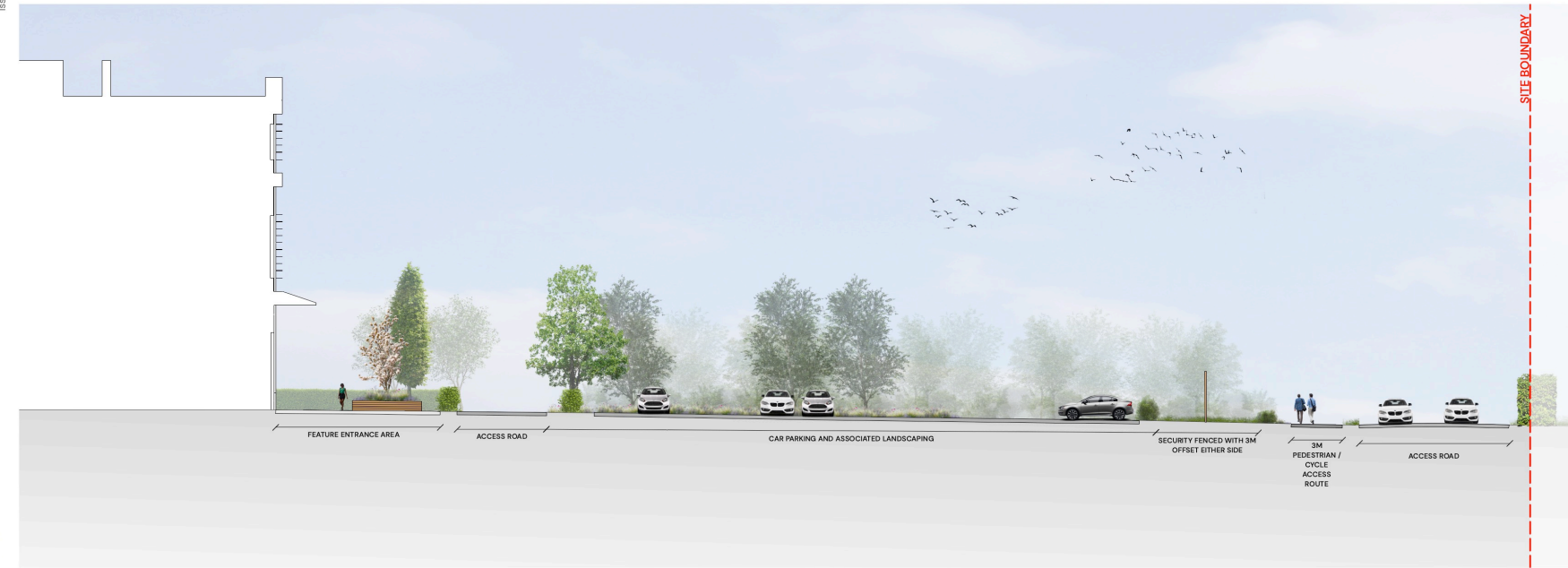
SECTION A-AA N 0 5 10 m