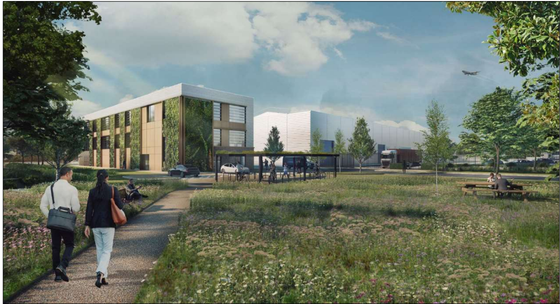
Photographic visual of proposed new replacement building and landscaping at front of site