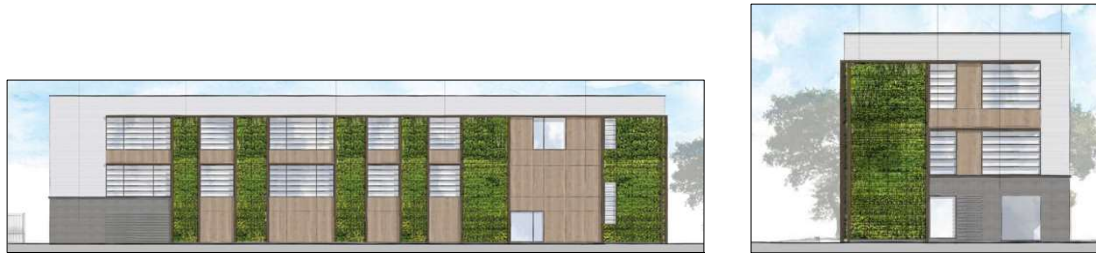
Proposed new replacement building – south-west and south-east elevations

accommodate the same quantum of floorspace as Building B and Building C combined and therefore consolidate built form on-site.