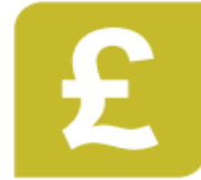
Providing financial sustainability